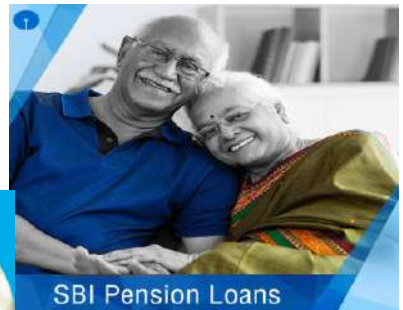
SBI Pension Loans