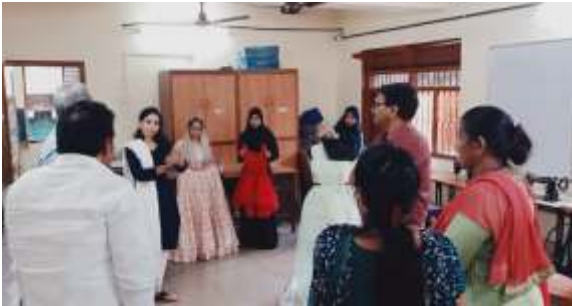
Fashion Design Studio Kurla