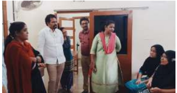
Beauty centre Visit by MLA