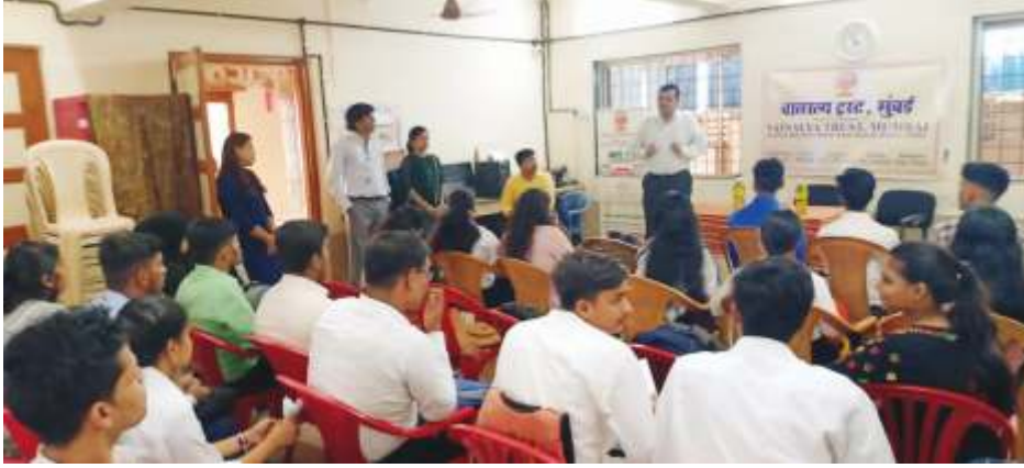
Job Fair by NIIT Kurla

We have started courses like Computers (Digital Literacy), Beauty and Wellness, Tailoring & Fashion Designing, Mobile Repairs. We intend to train marginalized youth in job oriented courses. We have trained 229 beneficiaries in 2021-22 and target to train 500 students during 2022-23. A vocational skilling for Divyang was initiated in August 2021 and 7 beneficiaries took part in the same.